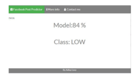
Fig. 4. Interface for the prediction result.